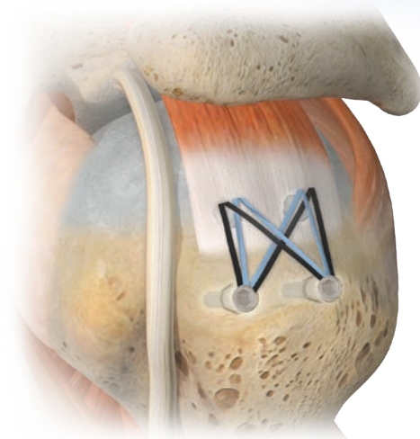
Knotless rotator cuff repair with the JuggerKnot All-Suture Anchor with Non-Sliding BroadBand Tape